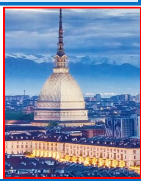
TORINO, 8 October 2016 SOCIAL EVENT and FAREWELL PARTY